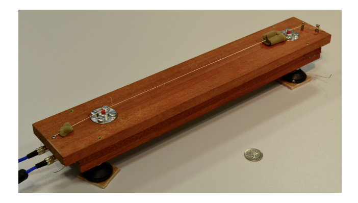
Figure 3: The string-board controller. The string is stretched over two bridge pistons, each of which rests on an internally mounted piezoelectric disk that sense the vibrations. Foam pieces are employed to suppress round-trip waves along the string.

native mode of interaction affords slightly different nuances in the generated excitation signals.